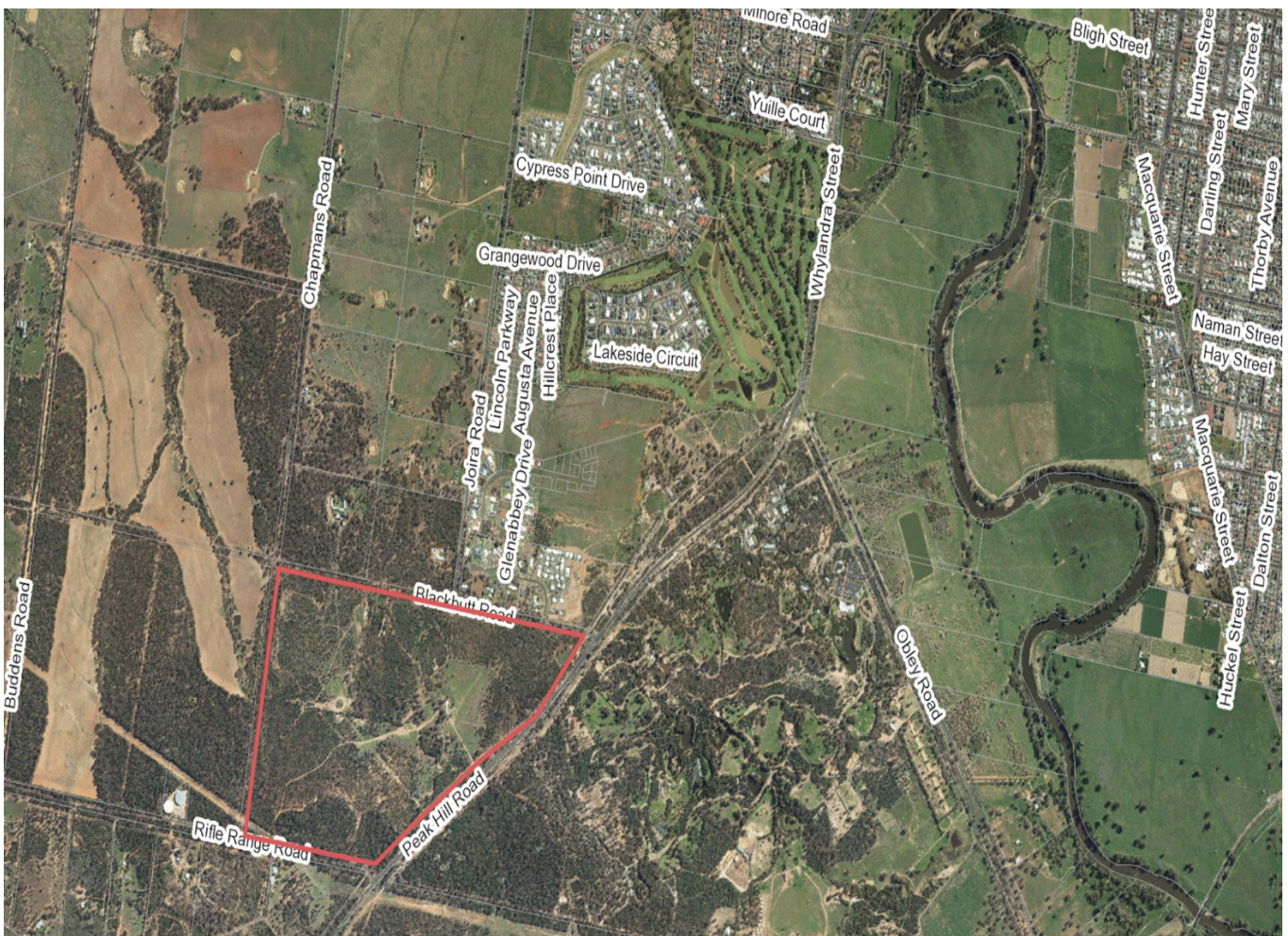
Figure 3. Lot 172 DP 753233, 20R Peak Hill Road, Dubbo

The allotment is located in south-west Dubbo and is boarded by Blackbutt Road to the north, Rifle Range Road to the south, Chapmans Road to the west and Peak Hill Road (Newell Highway) to the east. The site has an area of 98.14 hectares as shown in Figure 3 .